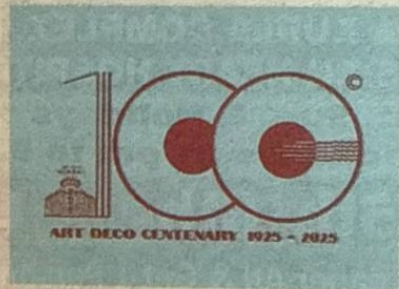
(Top) Speed lines on the logo alongside the Dominic building in Girgaon; (above) the new logo.