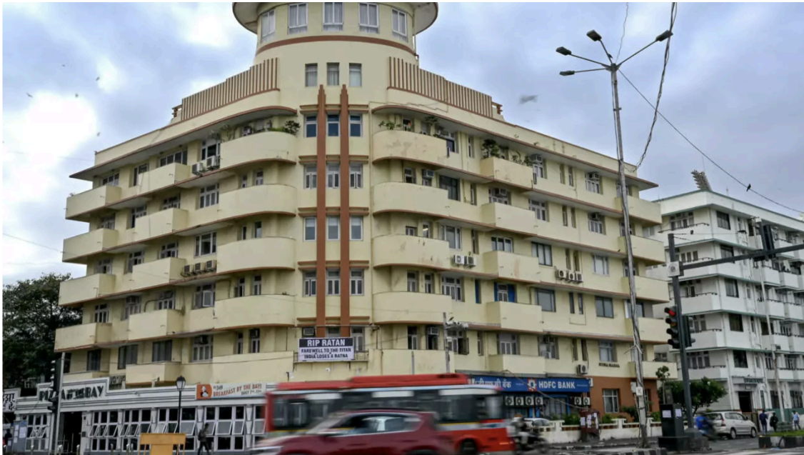
Mumbai's Art Deco treasures include apartment blocks, office buildings and a cinema

Issued on: 22/12/2024 - 02:37 Modified: 22/12/2024 - 02:36