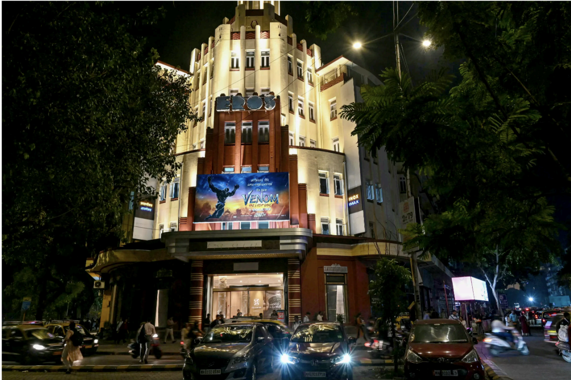
The Eros Cinema dazzles by night

A large part of this is due to a lack of awareness.