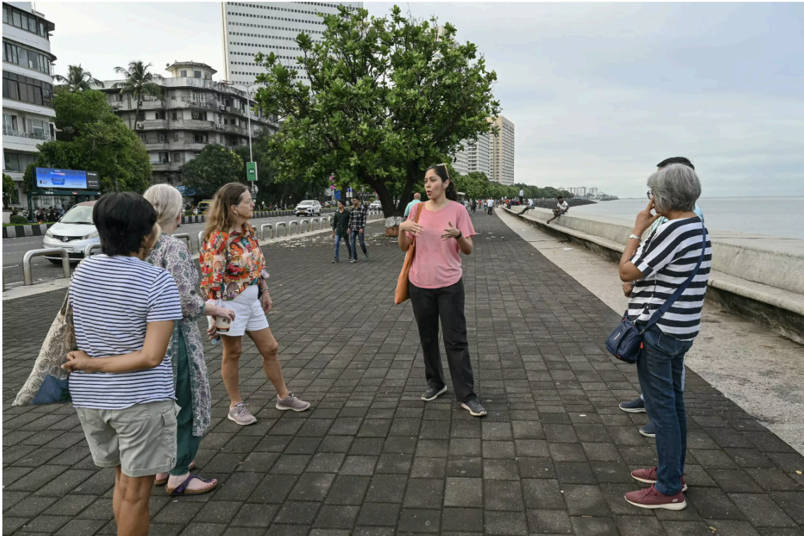
Enthusiasts are spreading the word about Mumbai's Art Deco buildings in a bid to preserve them