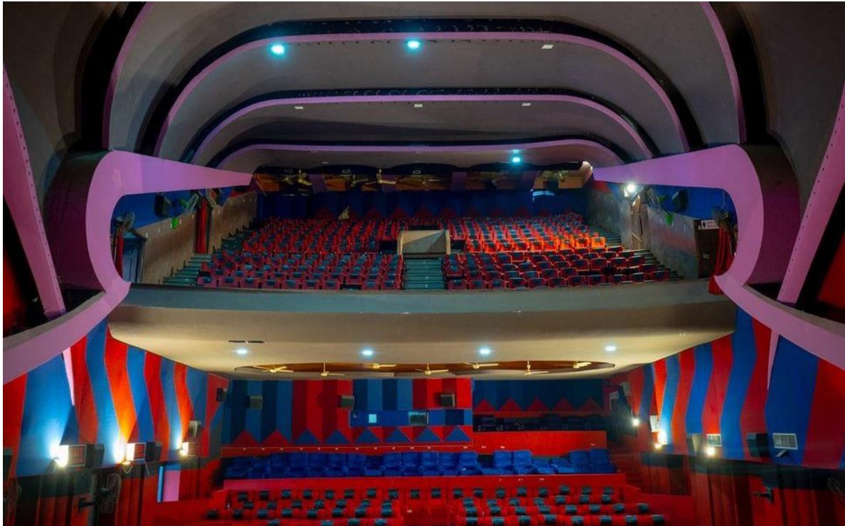
Uma Mandir in Maharashtra state's Solapur city has an auditorium that looks like a space capsule