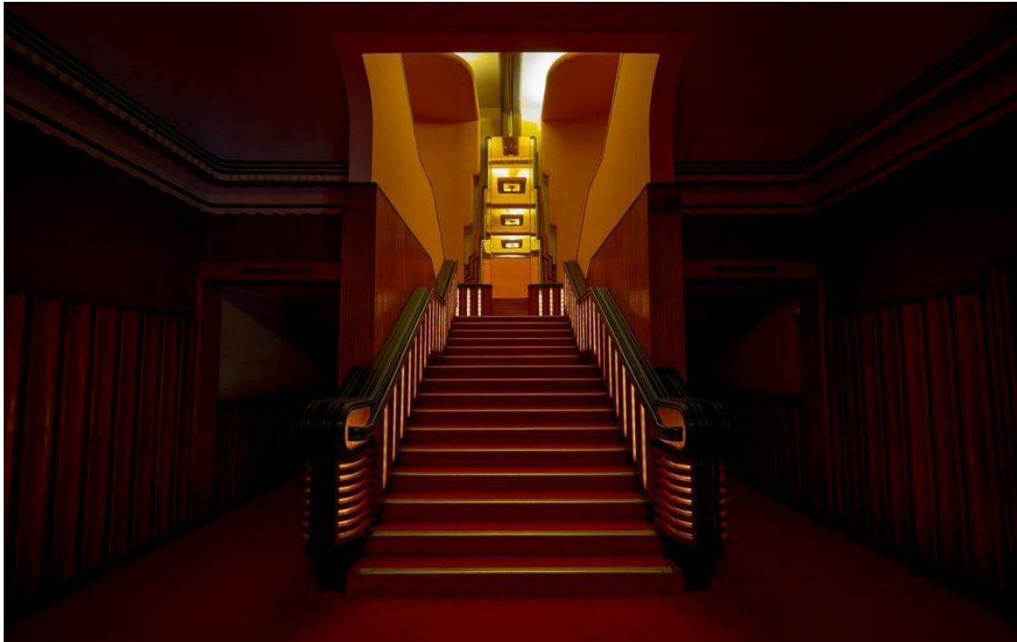
A stairway in Liberty cinema | Hemant Chaturvedi

"The city also saw a phase of reclamation that freed up land and created space for planned, public-focused buildings. At the same time, concrete began replacing stone and brick masonry as a primary construction material and this allowed for structures to take on more experimental shapes," he adds.