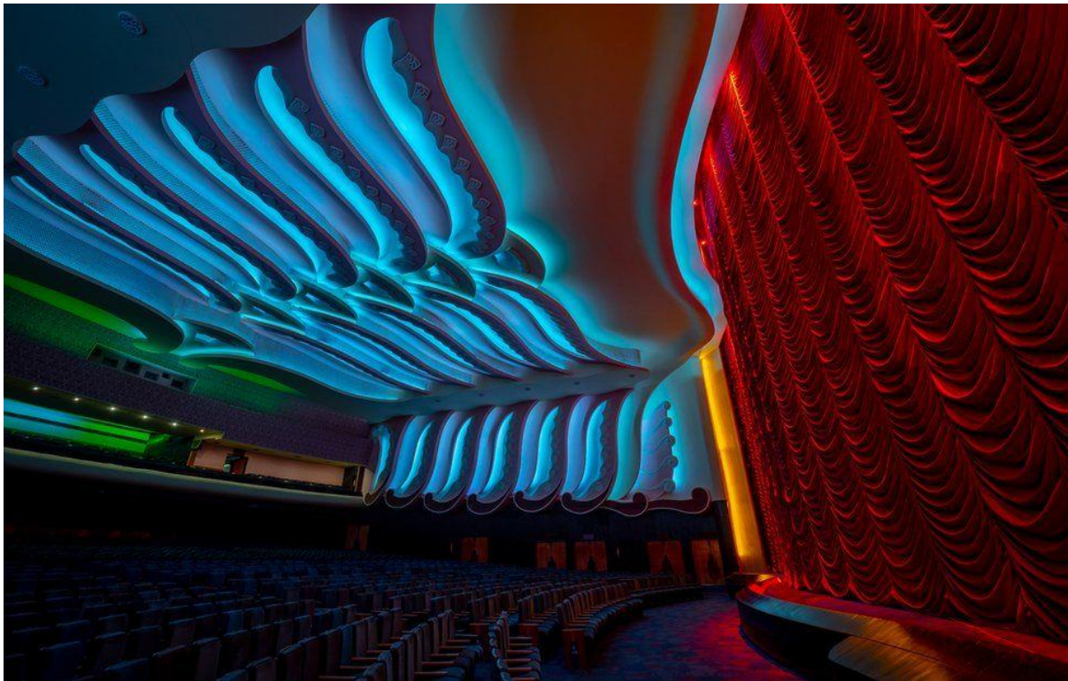
Raj Mandir cinema has a spell-binding ceiling